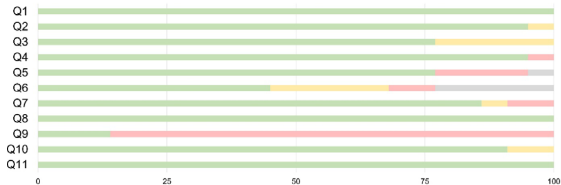
FIGURE 2. Critical appraisal for included reviews

% of criteria met: <50% high risk of bias; 50-75% medium risk of bias; >75% low risk of bias. Abbreviations: Y, Yes. N, No. U, Unclear. N/A, not applicable.