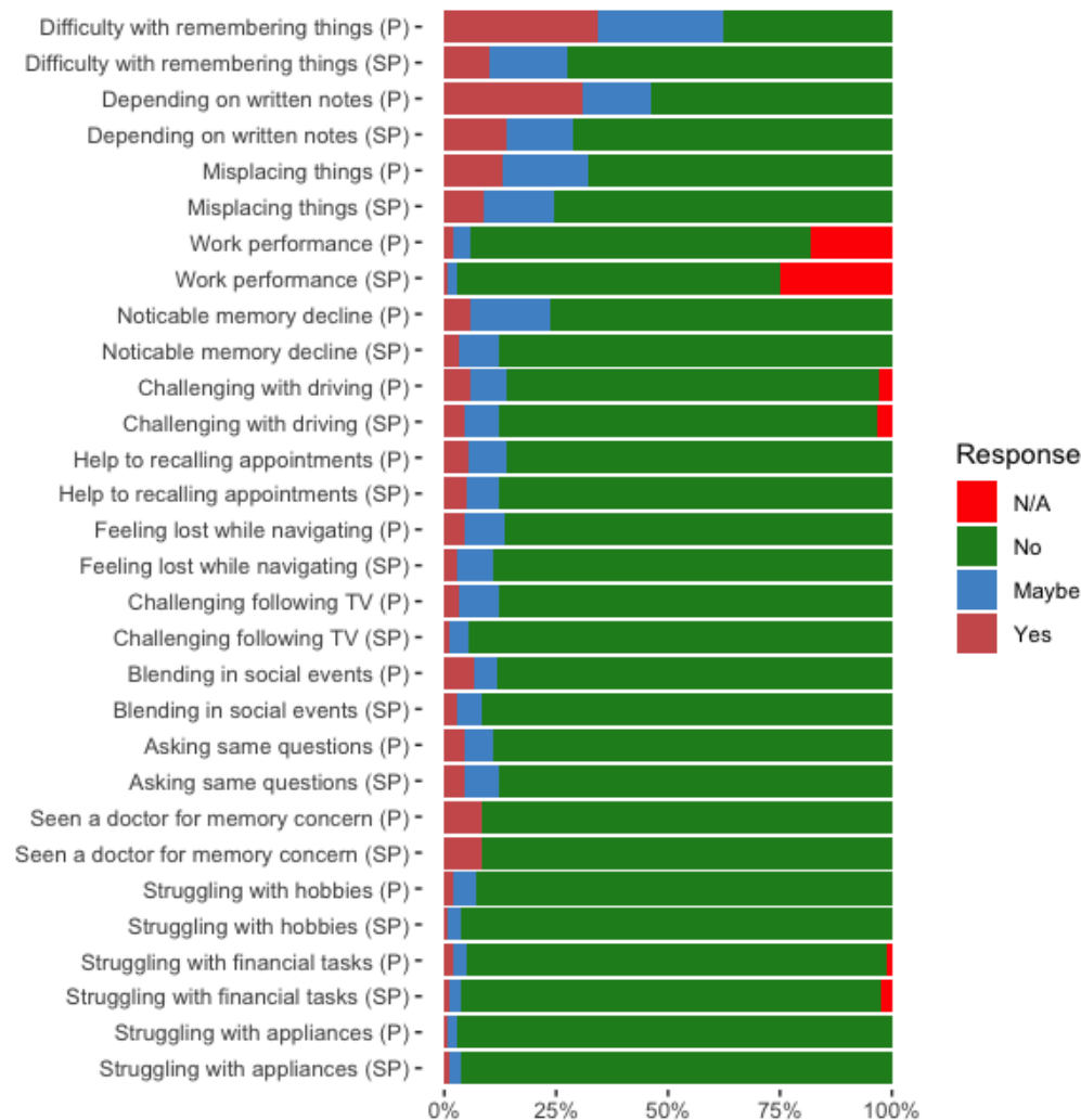
Figure 2 Proportion of endorsement on Cognitive Function Index (CFI) items as reported by participants and their study partners at the item-level analysis. (SP: Study Partner, P: Participants, N/A: Not applicable.)