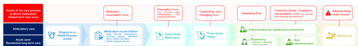
Figure 1. Archetypical care delivery process and potential points of error.

Medication-related harm poses significant health and economic burden globally. The global prevalence of medication related harm was 12%, of which 15% was severe and fatal, causing a mortality rate of up to 4.3 per 1000 patients. 1 In contrast, cardiovascular deaths caused by ischemic heart disease accounted for 1.09 deaths per 1000 patients. 2 The economic burden of medication-related harm is estimated at $30.1 billion and 79 billion euros in United States and Europe respectively. 3 Medication-related harm, also termed as adverse drug events (ADEs) include preventable or non-preventable harm caused by interventions related to medication use. 4 Preventable medication error can occur at any step from the physician prescribing medications to the patient receiving the medication. In turn, ADEs are under active surveillance during healthcare delivery to patients with health systems or pharmacovigilance activities.