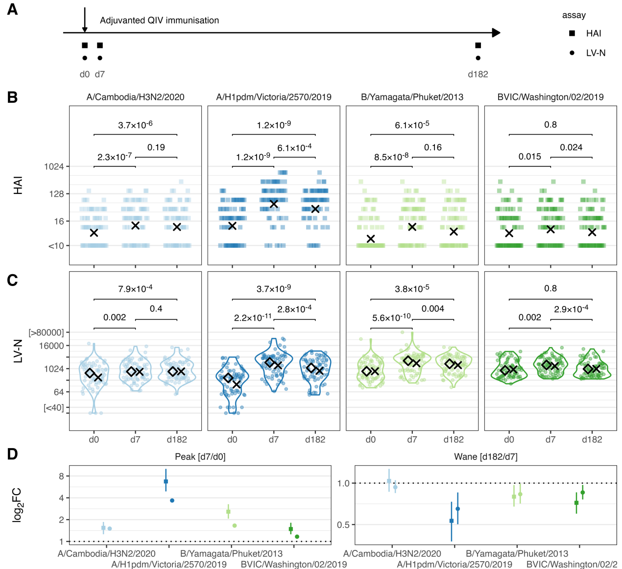
Fig 1. Serological vaccination responses quantified by haemagglutinin inhibition and high-throughput live influenza neutralisation assays in the AgeVax study (A) AgeVax study design 73 individuals >65yo were vaccinated with adjuvanted quadrivalent influenza vaccine in the 2021-22 Northern Hemisphere season. (B & C) Haemagglutinin inhibition assay titres (HAI, B ) or live-virus microneutralisation assay titres (LV-N, C ), expressed as the reciprocal of the dilution at which 50% of virus infection is inhibited ( IC_{50} ), at baseline (d0), and days 7 and 182 after vaccination (d7 & d182, respectively) for the flu viruses listed. (D) \log_2 fold changes for peak (d7/d0) and wane (d182/d7) response as measured by HAI or LV-N (plotted as squares or circles respectively). Bootstrapped 95% confidence intervals are shown. In (B & C), crosses indicate geometric means, and P values from 2-tailed paired Wilcoxon signed rank tests are shown. In (C), diamonds indicate medians.