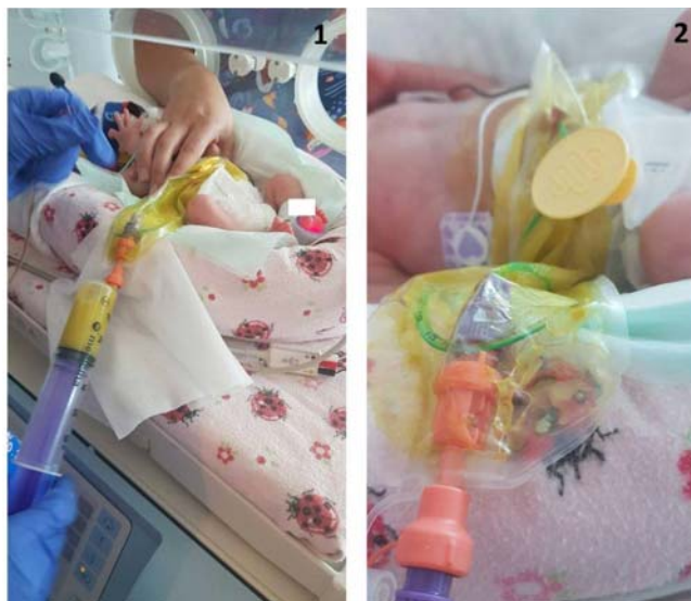
Figure 2: The neonatal chyme reinfusion system

1 = Syringe attachment and aspiration of chyme in preparation for reinfusion, 2 = Housing component attached to gastric feeding tube facilitating delivery of chyme to distal limb. Published with parental permission.