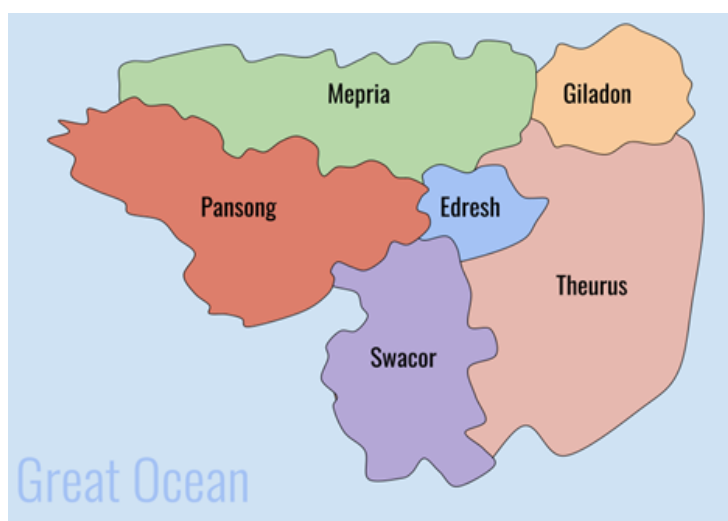
140 Figure 1: Fictional World of Zecan