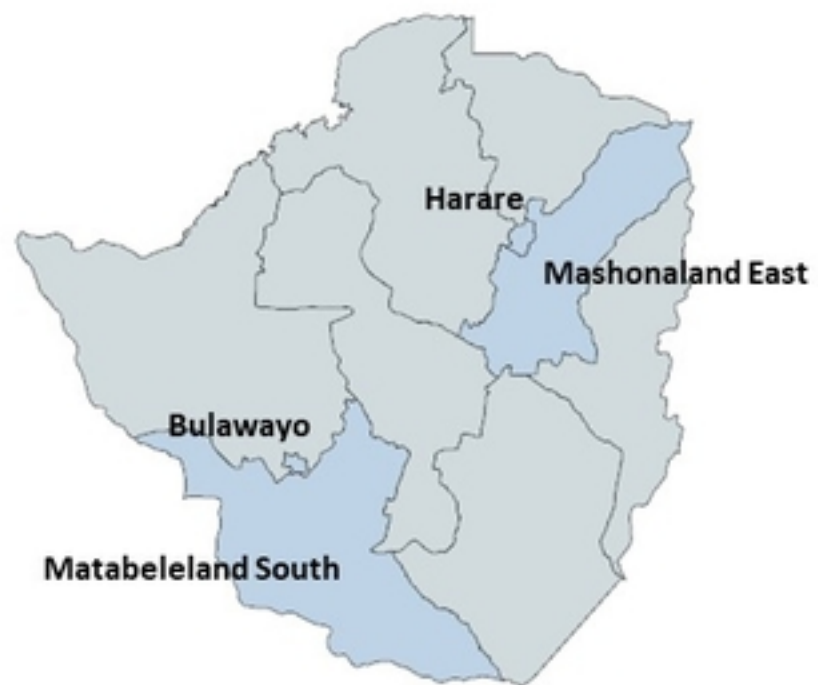
Figure 1: Provinces of Zimbabwe included in the KnowM M study