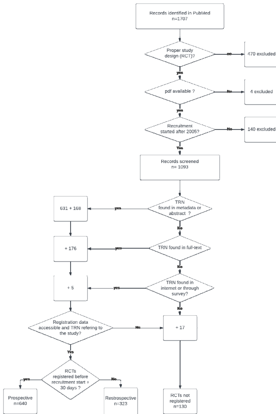
Figure 1. Flow diagram study selection

Legend: TRN search and retrieval of prospective/ retrospective status. Values correspond to the number of publications