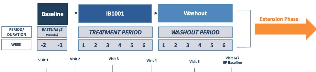
(A) IB1001-201 / IB1001-202