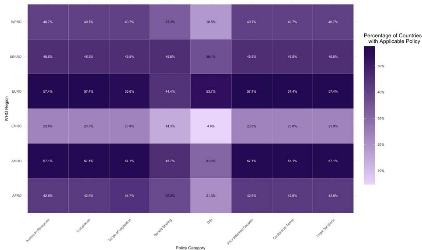
Figure 2: Heat map of percentage of countries within World Health Organization regions with legally-enforceable policy applicable to each subtopic. Shading represents the percentage of countries with applicable legislation, with darker shading indicating a higher percentage of countries with identifiable legislation pertaining to that subtopic category. Black numbering represents percentages less than 40.0%, while white numbering demonstrates percentages over 40.0%. Percentages were calculated as the number of countries within a WHO region with applicable policies for a subtopic divided by the total number of countries in the WHO region and rounded to the nearest tenth.