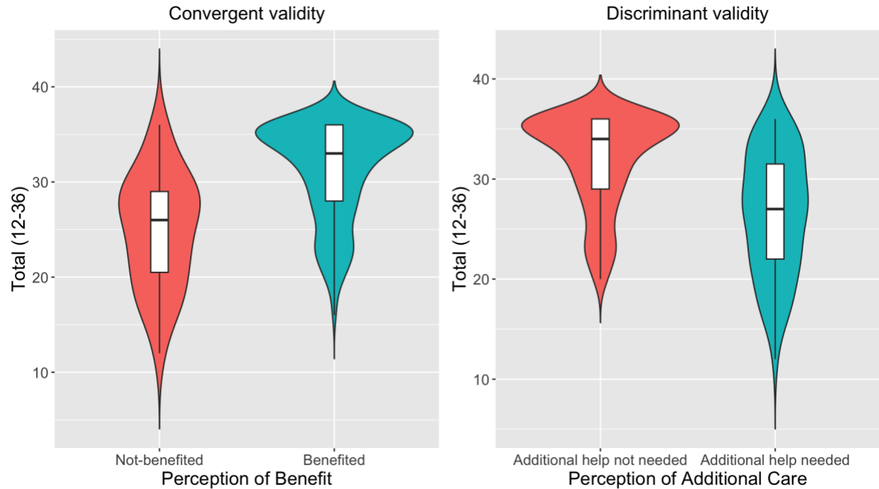
Figure 1. Convergent and discriminant validity comparing ESQ Total Score with perception of benefit and additional care