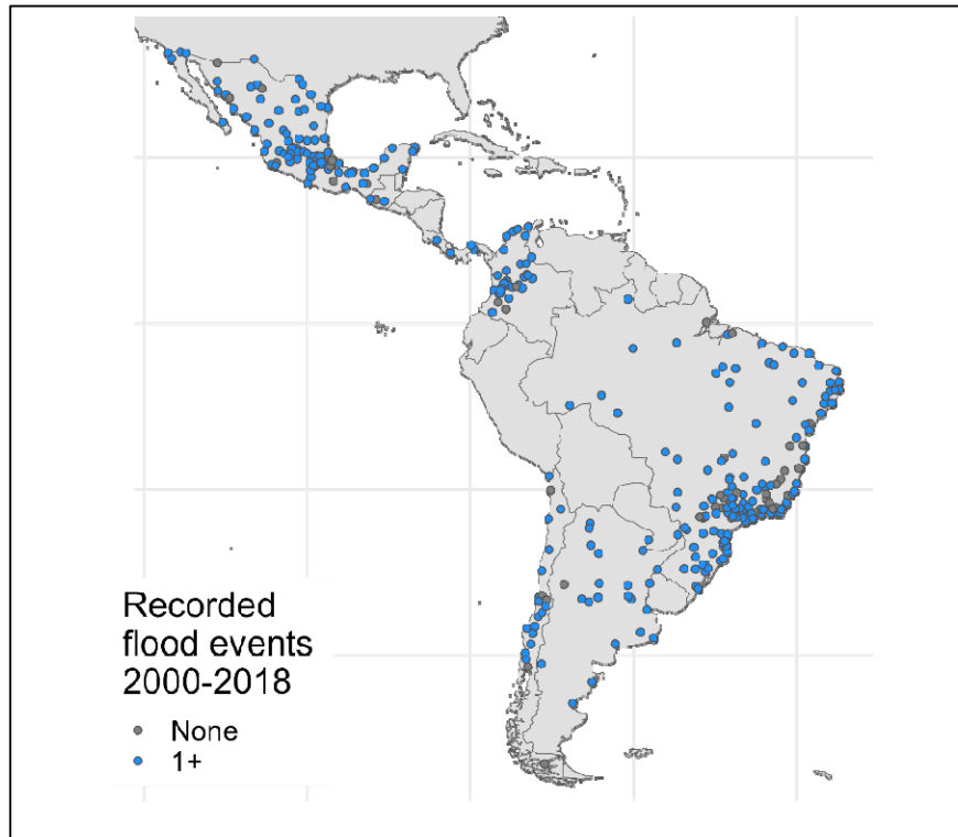
Figure 1: Study cities with recorded floods from 2000-2018. 276 cities had recorded floods and were included in the analysis (blue color), 50 cities had no recorded floods and were excluded (dark gray color).