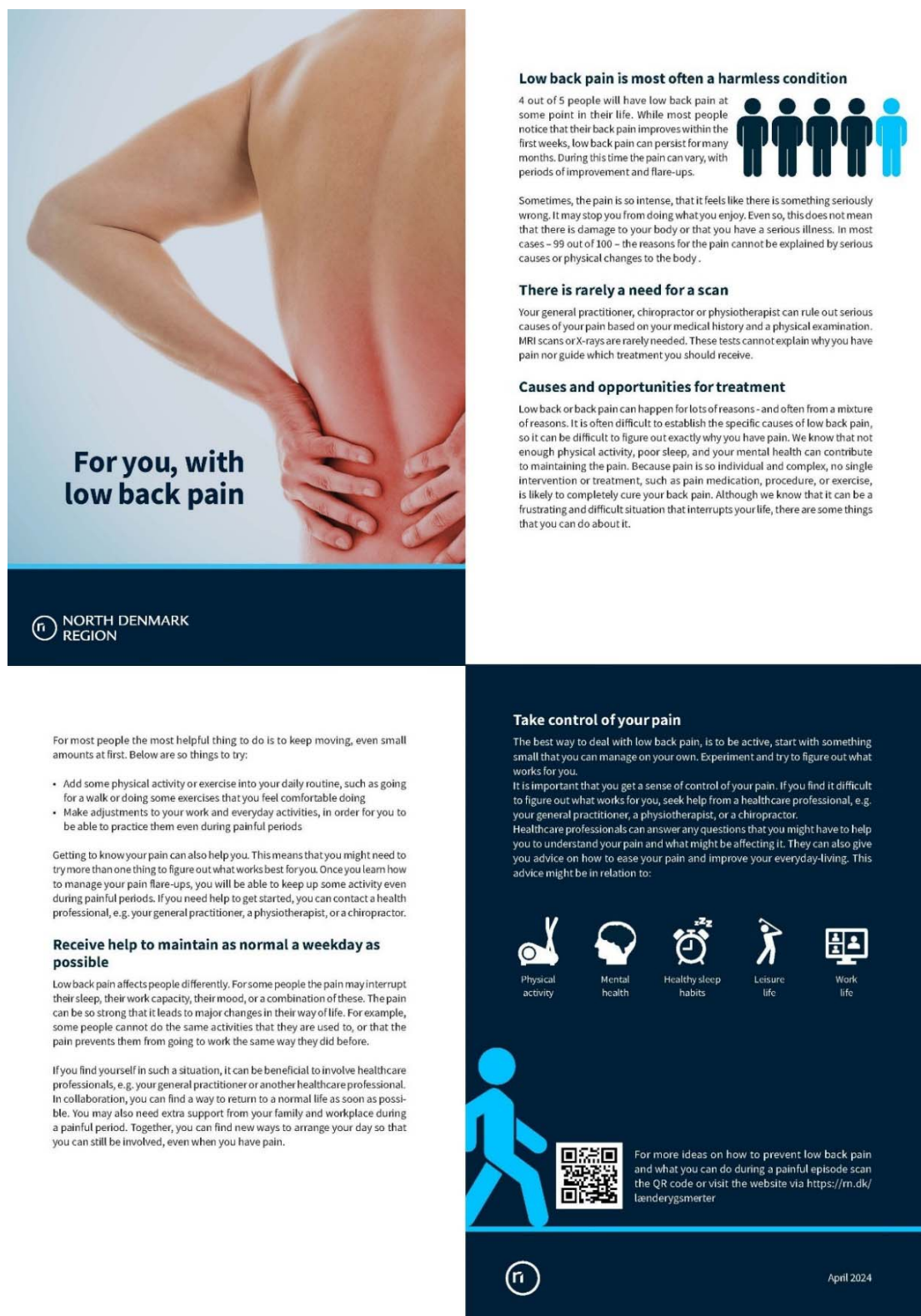
Figure 2. The leaflet is on an A4 page that is folded in the middle. The English version of the Choosing Wisely leaflet have not been think aloud tested. Only the Danish version have been revised based on end-user perspectives (Think-aloud interviews). Therefore, the English version of the Choosing Wisely leaflet is our translation exclusively.