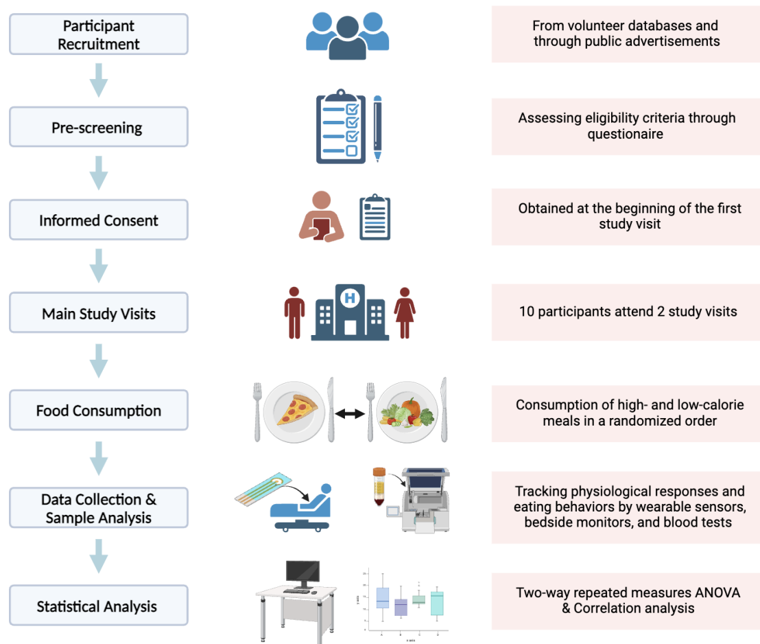
Figure 2 Flowchart of clinical study design. This flowchart outlines the process of investigating the effects of high- and low-calorie meal consumption on physiological responses. The study design involves the following steps: Participant Recruitment, Pre-screening, Informed Consent, Main Study Visits, Food Consumption, Data Collection, Sample and Statistical Analysis.

Study Visit Overview: The overview of the study visit is shown in Figure 3. Participants will attend two main study visits at the NIHR Imperial Clinical Research Facility, during which they will consume high and low-calorie meals in a randomized order. Each visit will involve monitoring physiological parameters such as Tsk, blood SpO 2 , and HR using a bedside monitor and a non-invasive, wearable multimodal sensor band developed by Dr Mayue Shi. Each study visit will take no more than 2 hours.