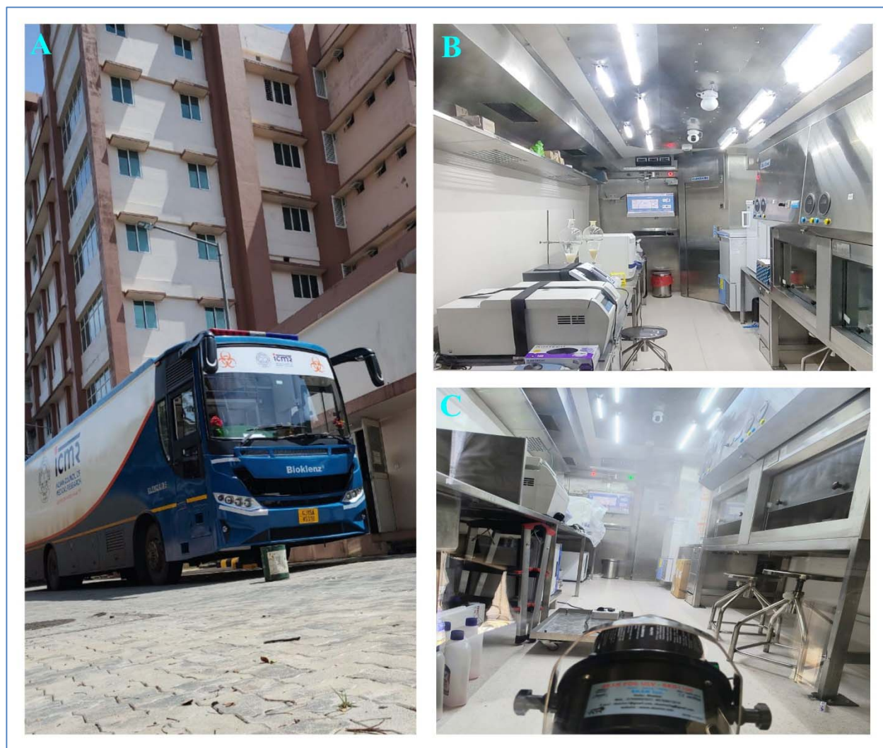
Figure 3. Representative images of the onsite activities of MBSL-3 laboratory during nipah outbreak 2023: A) MBSL-3 laboratory stationed in the campus of Government Medical College, Kozhikode, Kerala, India. B) The inside view of the MBSL-3 laboratory. C) Decontamination of the MBSL-3 laboratory using H 2 O 2 fogger.