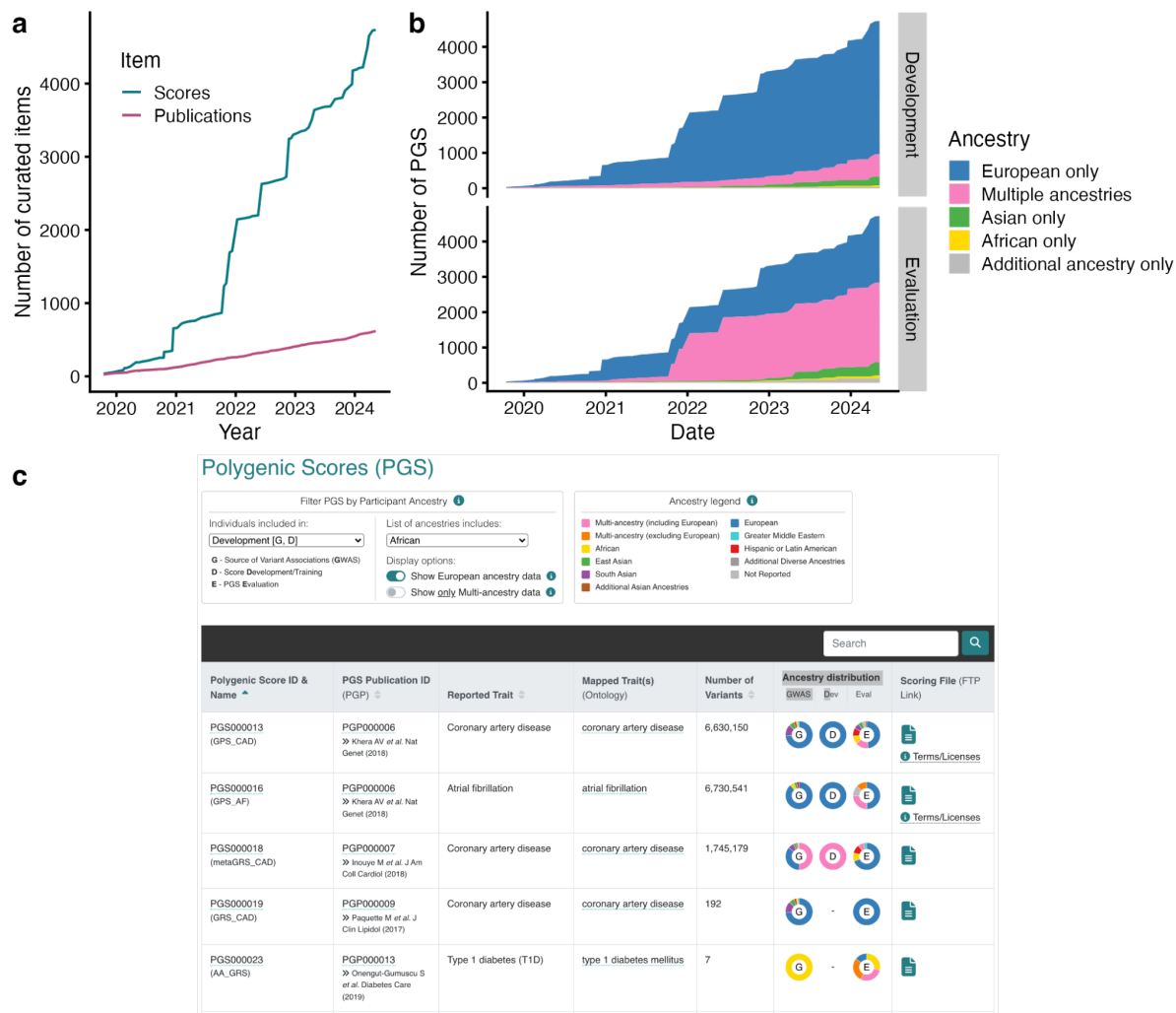
Figure 1. Data growth and improvement of the PGS Catalog. (a) Cumulative numbers of PGS (scores) and publications indexed in the PGS Catalog since inception (October 2019). (b) Cumulative numbers of PGS indexed in the Catalog since inception stratified by ancestry groups contributing to PGS development (i.e. GWAS and score development, top panel) or evaluation (bottom panel). Ancestry groups with lower numbers of PGS have been combined into larger groupings to visualize broader trends in single-ancestry and multi-ancestry data. (c) Example of ancestry filter present on every table with multiple PGS, the filter has been set to identify any PGS with African ancestry samples used for development (shown here are the first 5 of 348 PGS).