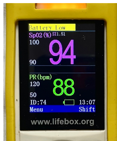
Figure 3. Images of the first version of the family member observation chart and the pulse oximeter used, illustrating the discrepancy between positioning of heart rate (bottom, in green on the pulse oximeter) and oxygen level (top, in pink on the pulse oximeter)