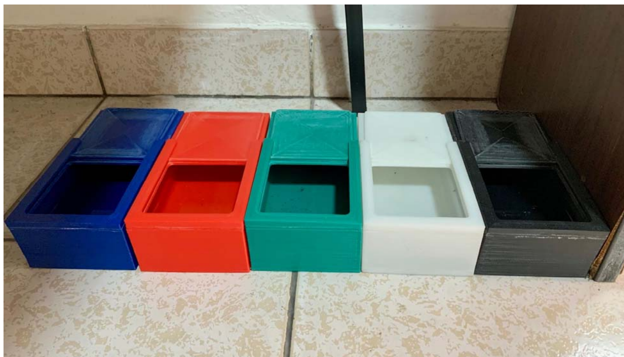
Figure 2: Photograph depicting HCBS devices in all colors used during the experiment, installed in their respective locations.