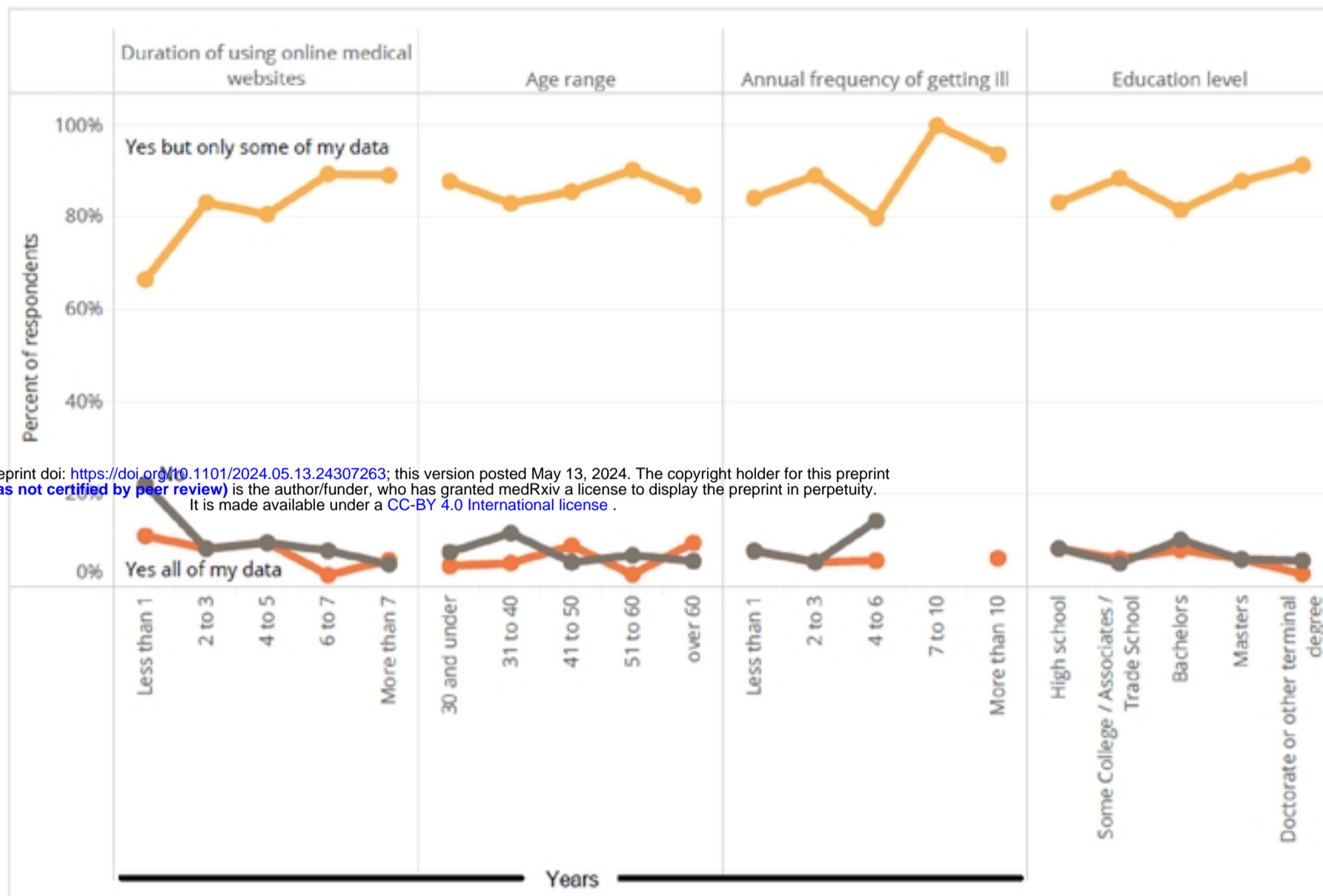
Figure 3. Graphical illustration of participants' willingness to donate none, some, or all data after death based on duration of using online medical websites (n= 397), age range (n= 397), annual frequency of getting ill (n= 395), and education level (n= 397)