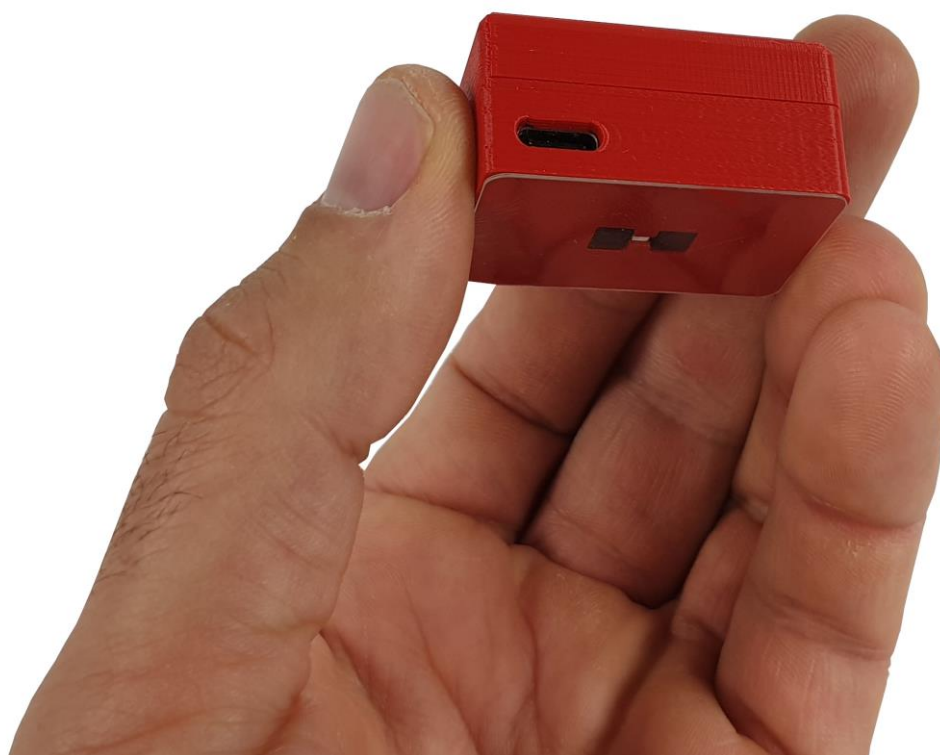
Figure 1. Picture of the penile self-developed sensor (measuring 41 x 27 x 19 mm)

it was chosen to first investigate the ability of detecting LRH values before a SpO 2 sensor for the penis will be developed. See Figure 1 for an impression of the device.