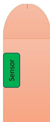
Figure 3. A schematic representation of how the sensor is placed on the penis; top view of the penis with the sensor