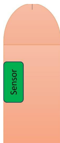
Figure 3. A schematic representation of how the sensor is placed on the penis; top view of the penis with the sensor