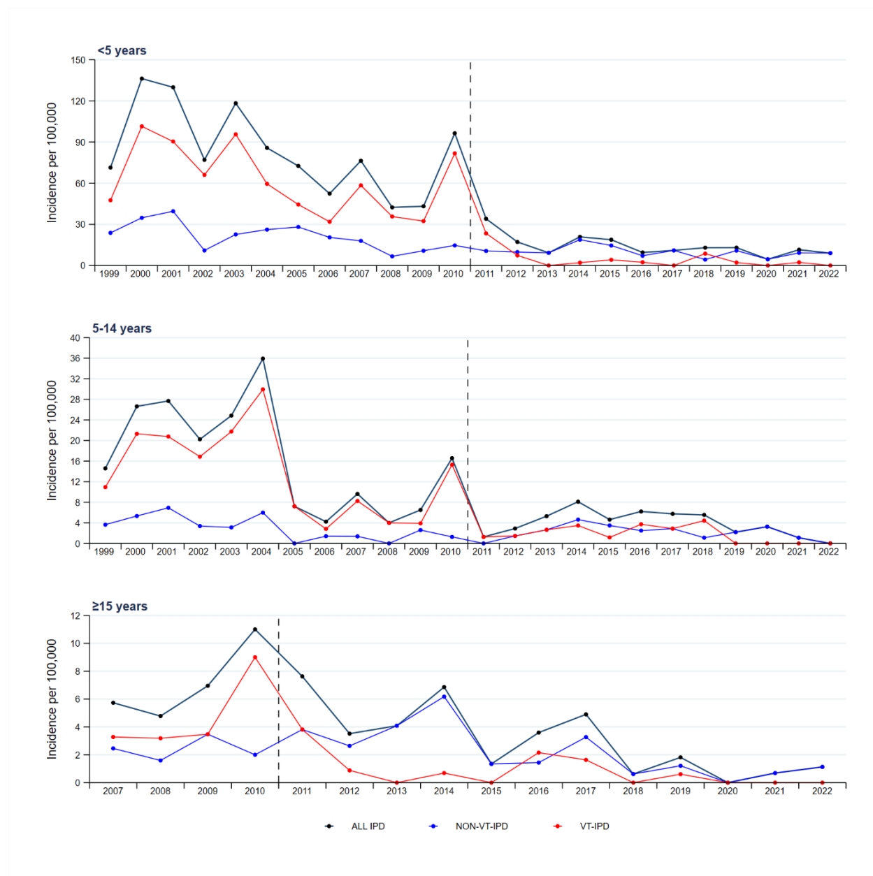
Figure 1. Incidence of vaccine serotype (VT), non-VT and all serotype invasive pneumococcal disease (IPD) among residents of the Kilifi Health and Demographic Surveillance system by age group, 1999-2022.