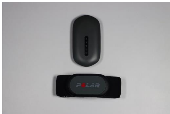
Fig 2. Wearable GSP Sensor Tracking (Catapult, Australia), Wearable Heart Rate Sensor (Polar, USA)