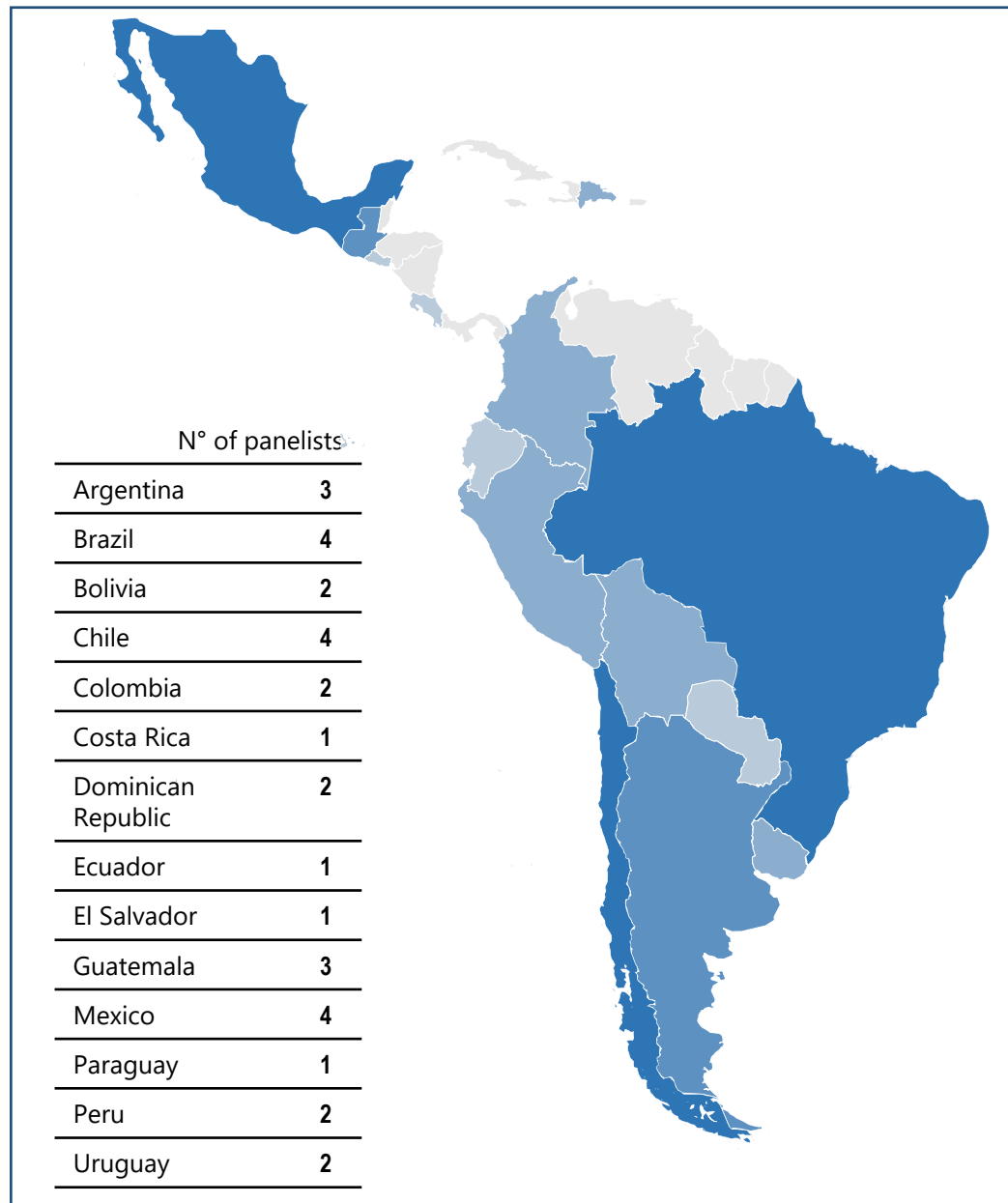
Figure 2. Distribution of panelists in Latin America