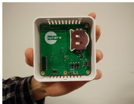
Fig. 4: Housing unit containing the environmental sensor package.