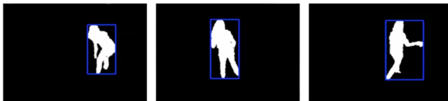
Fig. 3: Silhouette sensing in SPHERE: Images from 3D infrared cameras are reduced to non-identifiable silhouettes and bounding boxes. Here a person is shown cooking.

Environmental Sensors Whereas the wearable and silhouette sensors measured features relating to individuals, the environmental sensors captured features relating to wider ambient aspects of the home environment. The environmental sensors deployed in SPHERE are: