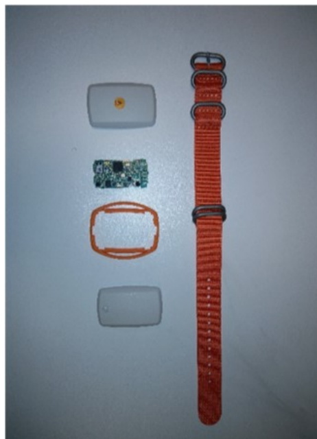
Fig. 2: The SPHERE wearable.

a privacy-preserving algorithm for wearable embedded systems (Fafoutis et al., 2016).