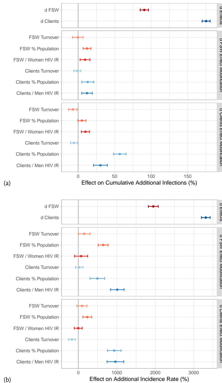
Figure 3: Estimated effects on relative additional infections of disproportionate viral non-suppression ( d ) among FSW and clients vs population overall, plus effect modification by epidemic conditions

(a) cumulative additional infections, (b) additional incidence rate by 2030 vs base case; FSW: female sex workers; Clients: of FSW; IR: incidence ratio in 2020; d_i : difference in subpopulation- i -specific viral non-suppression vs population overall within counterfactual scenario; points and error bars: mean and 95% CI for each effect estimated via Eq. (2).