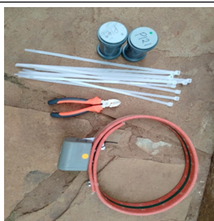
347 348 349 350 351 352 353 354 355 Figure 4: CatLog2 GPS logger (top) and Savannah GPS logger (bottom), with the items used for affixing the loggers.

346 Affixing the Savannah Tracker GPS logger was straightforward due to its adjustable neck collar.