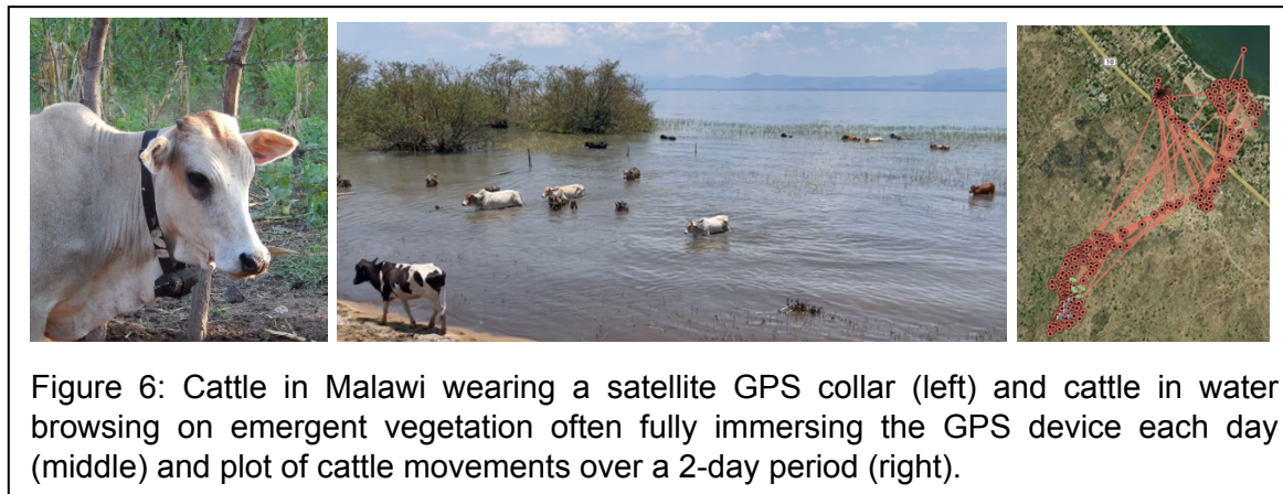
Figure 6: Cattle in Malawi wearing a satellite GPS collar (left) and cattle in water browsing on emergent vegetation often fully immersing the GPS device each day (middle) and plot of cattle movements over a 2-day period (right).

384 The manufacturer guaranteed their waterproofing, to a depth of 1m for up to 30 minutes. 385 Nevertheless, the GPS tracking devices were not fully waterproof. If the animal stayed in the water 386 for a long time, the moisture penetrated the device and caused false distances.