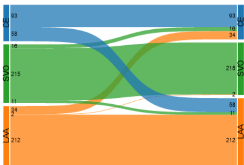
External test dataset 3