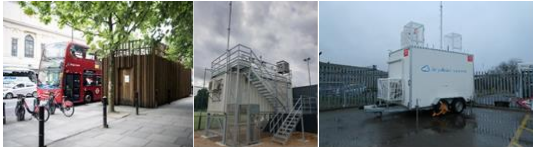
Figure 2: Air quality supersites: Marylebone Road (left), Honor Oak Park (centre), mobile measurement station (not in location).

measurement capability as the supersites. This location provides the contrast in non-exhaust contributions, being next to the high speed A40 flyover.(Figure 2).