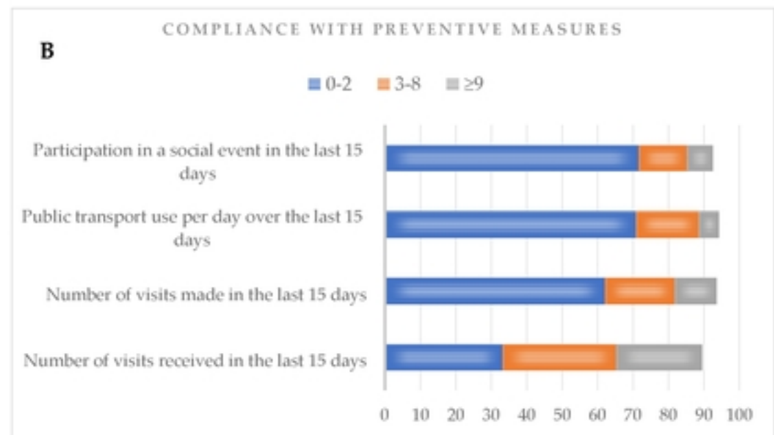
Figure 2: Compliance with Preventive measures recommended by authorities