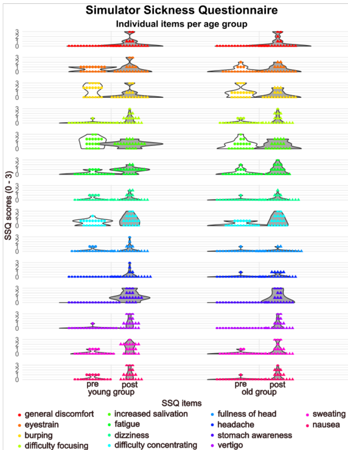
Figure 4. Cybersickness ratings. Single item ratings in the Simulator Sickness Questionnaire (SSQ) at the beginning (pre) and after ending (post) the exposure to the Tilted Reality Device (TRD) separate for both age groups. The violin plots illustrate the distribution of group ratings for each item. The items were rated on a 4-point Likert scale ranging from 0 to 3 (0 - none, 1 - slightly, 2 - moderately, 3 - severely).