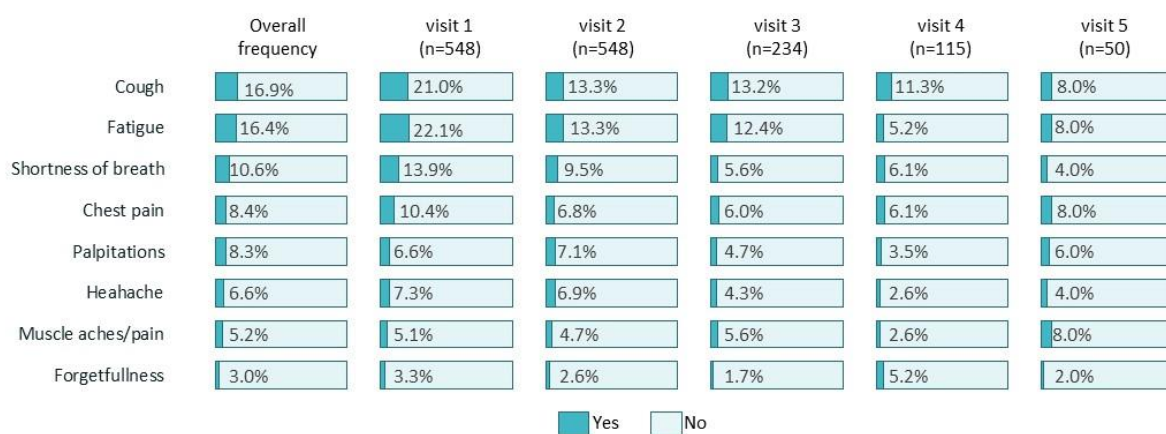
267 268 Fig 3: Longitudinal frequency of most common long COVID symptoms by PAC-19 clinic visit, Aug. 2020 - 269 Jan. 2023

258 long COVID symptoms were cough (16.9%), fatigue (16.4%), shortness of breath (10.6%), chest pain 259 (8.4%), headache (8.3%), palpitations (6.6%) and muscle aches/pains (5.2%), and forgetfulness (3.0%). 260 The prevalence of long COVID significantly declined ( p < 0.001 ) from 75.4% at the first PAC-19 clinic visit 261 to 53.5% at the second visit, 59.8% at the third visit, 49.6% at the fourth visit, and 26.0% at the final visit 262 (S3 Table). Overall, the proportion of vaccinated patients attending PAC-19 clinics increased from 20% at 263 the first visit to 58% at the fifth visit; an increase that will statistically significant ( p < 0.001 ). Similarly, 264 comparatively significantly ( p = 0.002 ) larger proportion of patients with comorbidities presented in 265 subsequent PAC-19 clinic visits than at the first visit. The proportion of patients with newly diagnosed 266 medical conditions longitudinally declined; this was, however, non-significant ( p = 0.953 ).