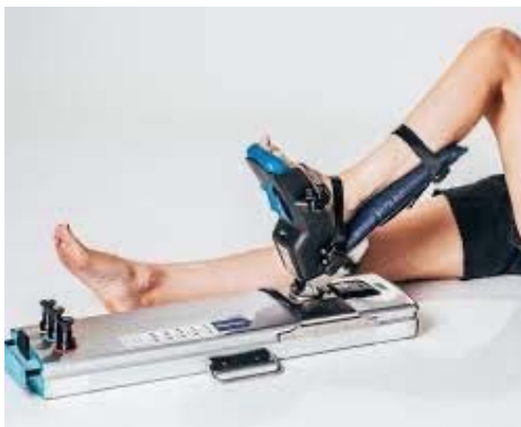
Figure 1: Illustration of the S-Press device