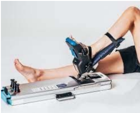
Figure 1: Illustration of the S-Press device