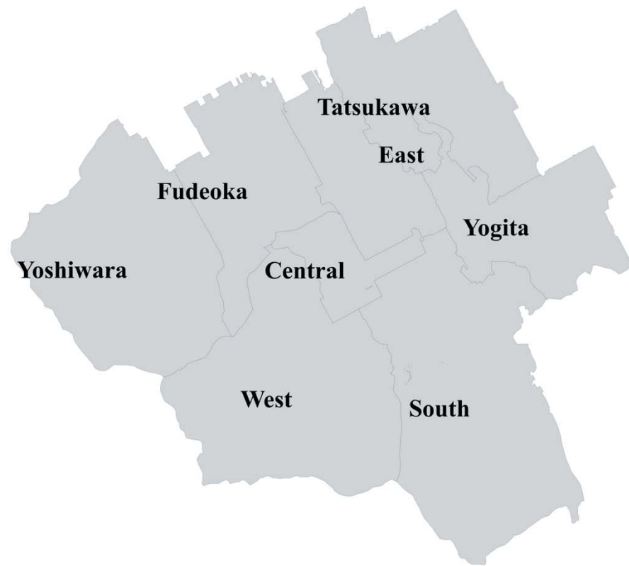
Figure 2. Map of Zentsuji City districts.