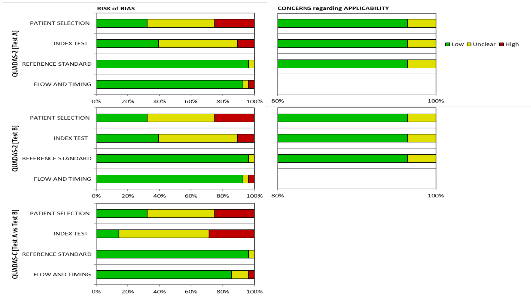
Figure 1. Graphical display of quality appraisal results for studies included in the synthesis of the rapid review