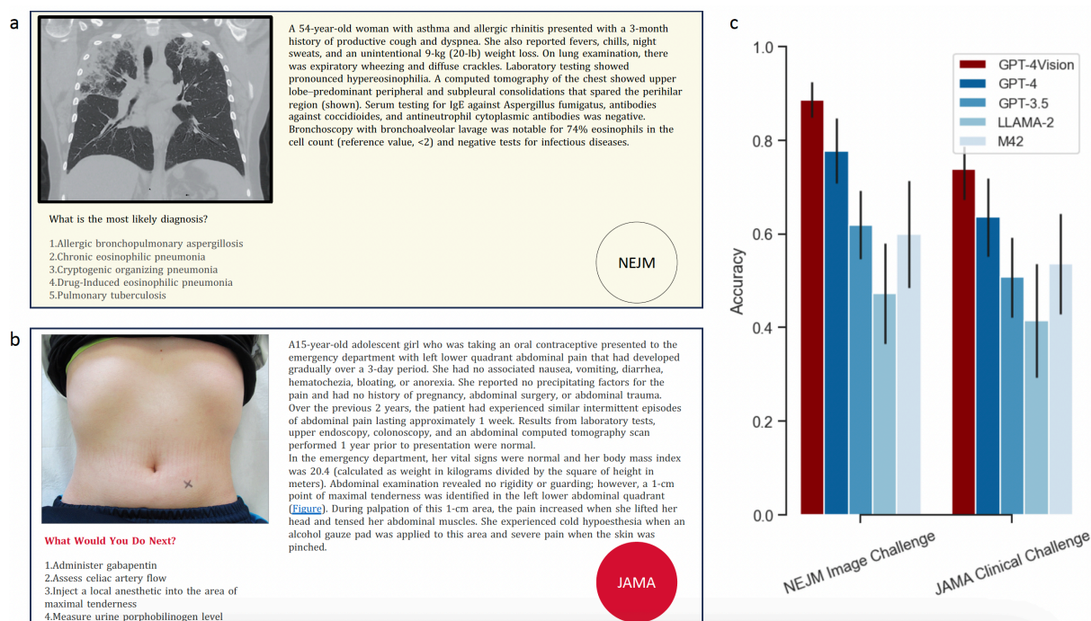
Figure 1: Illustrative examples of the clinical case descriptions from JAMA (a) and NEJM (b) and accuracy of the proprietary models GPT-4 Vision, GPT-4, GPT-3.5, and of the open-source models Llama2 and Med24 in answering the questions (c).