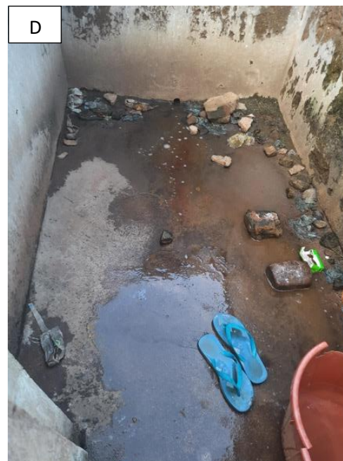
Figure 2: GWS characteristics observed during data collection