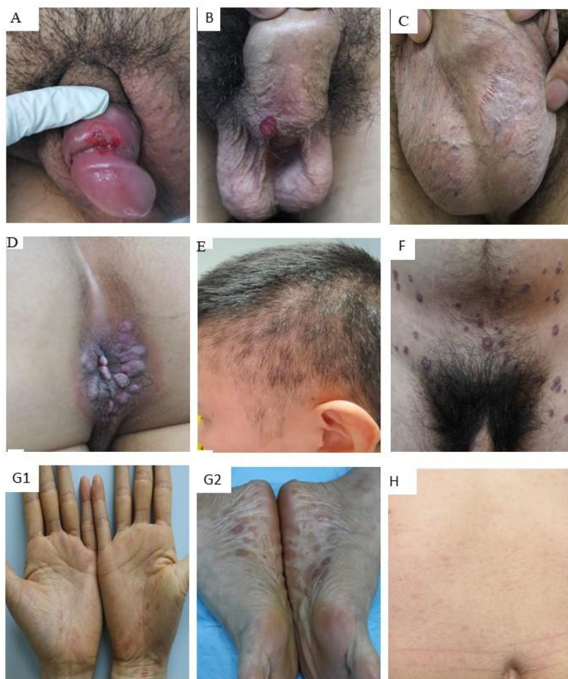
A. Penile chancre. B. Chancre near scrotum. C scrotal maculopapular rash of secondary syphilis. D. perianal condyloma lata. E. Alopecia of secondary syphilis. F, G1, and G2. Psoriaform rash of secondary syphilis. H. Recently appeared rash of secondary syphilis (TRUST titer 1:4)