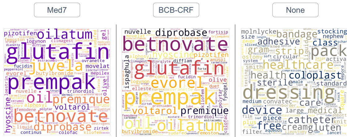
Figure 2. Word-clouds of top entities retrieved but not mapped to ATC codes by only one of the models: the MED7 module of the baseline model or the BCB-CRF model. The third panel shows the top terms from drug product entries with no entity DRUG retrieved by any of the drug NER models.

Fine-tuning with both n2c2 and the UKB prescription dataset greatly benefited the entities STRENGTH and DOSAGE compared to the baseline. The baseline model performed poorly for entity DOSAGE with precision and recall scores of 0.66 and 0.24, respectively. Likewise, entity STRENGTH had a precision of only 0.5, whereas the BCB-CRF model achieved a precision of 0.96. This is partly because the baseline consistently mislabelled the total prescribed unit count as STRENGTH instead of DOSAGE, resulting in low recall for DOSAGE (0.2) and low precision for STRENGTH (0.5).