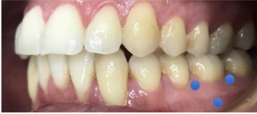
Figure 4 - Laser application regions on the vestibular face. In the same position, lingual irradiation will be carried out

medRxiv preprint doi: https://doi.org/10.1101/2023.10.02.23296466 ; this version posted October 3, 2023. The copyright holder for this preprint (which was not certified by peer review) is the author/funder, who has granted medRxiv a license to display the preprint in perpetuity. It is made available under a CC-BY 4.0 International license .