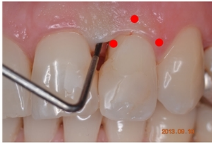
Figure 2 - Laser application on the buccal surface

medRxiv preprint doi: https://doi.org/10.1101/2023.09.28.23296306 ; this version posted October 4, 2023. The copyright holder for this preprint (which was not certified by peer review) is the author/funder, who has granted medRxiv a license to display the preprint in perpetuity. It is made available under a CC-BY 4.0 International license .