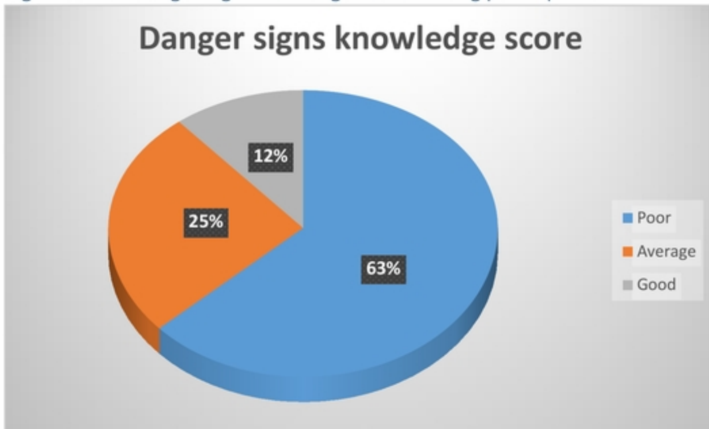
Fig 2: Overall danger sign knowledge score among participants

It is made available under a CC-BY 4.0 International license .