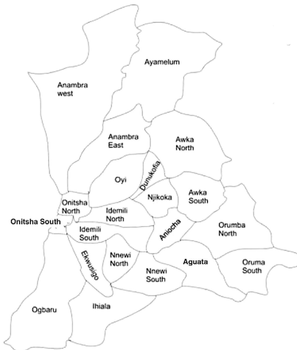
Figure 1: Map of Anambra State Showing the 21 Local Government Areas 13

of tuberculosis and HIV/AIDS co-infection were highest in those aged 15 to 25 years (443, 30.7%), in married patients (633, 43.9%), and in traders/business owners (731, 50.7%).