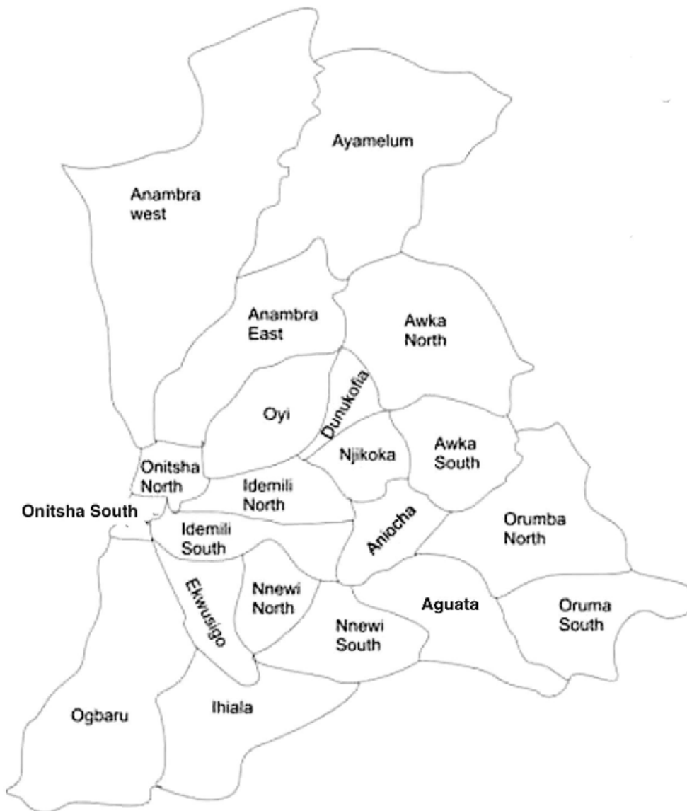
Figure 1: Map of Anambra State Showing the 21 Local Government Areas 13

of tuberculosis and HIV/AIDS co-infection were highest in those aged 15 to 25 years (443, 30.7%), in married patients (633, 43.9%), and in traders/business owners (731, 50.7%).