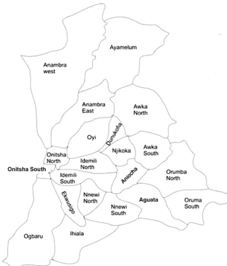
Figure 1: Map of Anambra State Showing the 21 Local Government Areas (Ezenwaji et al., 2014)