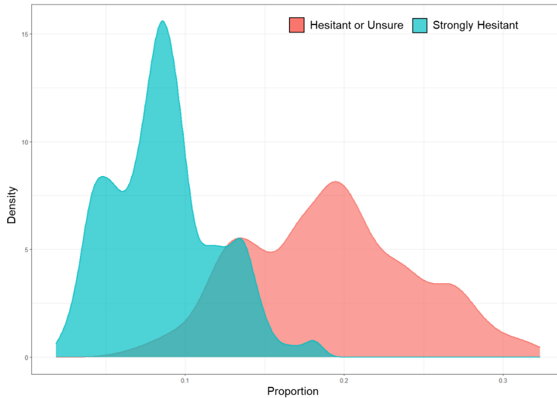
Figure 1. Density distribution of the proportion of people feeling Hesitant or Unsure and Strongly Hesitant to take the COVID-19 vaccine at the county-level.