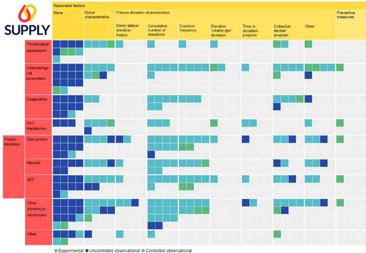
FIGURE 4. Evidence gap map with health effects. The columns contain factors that have been studied in association with health effects. Squares represent studies, subdivided according to study design. An interactive version of the map is available online , in which descriptions of categories can be obtained by hovering over the column/row headers, lists of studies within each category can be obtained by clicking on the map, and studies can be filtered based on study design, publication type, publication date, location, publication language, follow-up period, population, and whether or not convalescent plasma was donated. Generated using v.2.2.4 of EPPI-Mapper powered by EPPI Reviewer and created by the Digital Solution Foundry team.