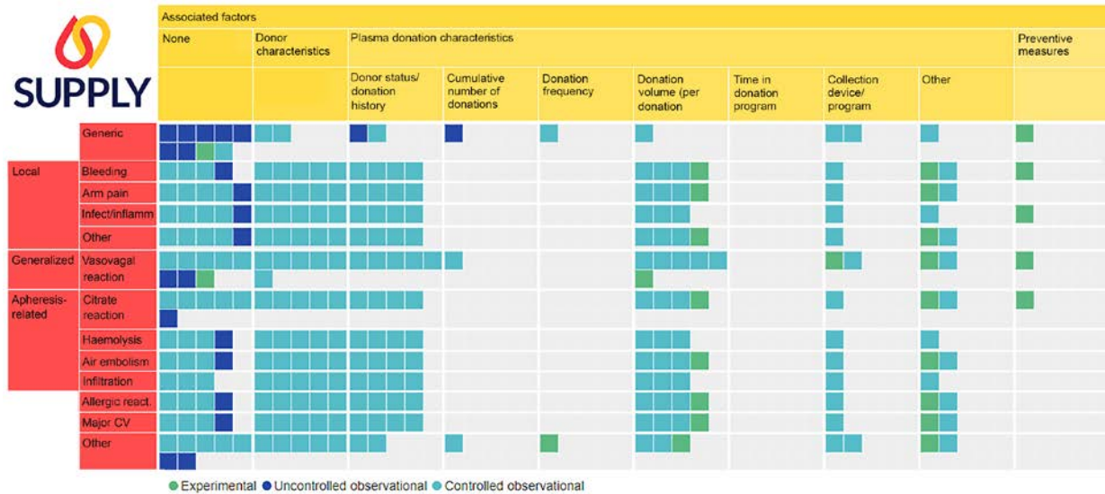
FIGURE 3. Evidence gap map with adverse events. The columns contain factors that have been studied in association with adverse events. Squares represent studies, subdivided according to study design. An interactive version of the map is available online , in which descriptions of categories can be obtained by hovering over the column/row headers, lists of studies within each category can be obtained by clicking on the map, and studies can be filtered based on study design, publication type, publication date, location, publication language, follow-up period, population, and whether or not convalescent plasma was donated. Generated using v.2.2.4 of EPPI-Mapper powered by EPPI Reviewer and created by the Digital Solution Foundry team.