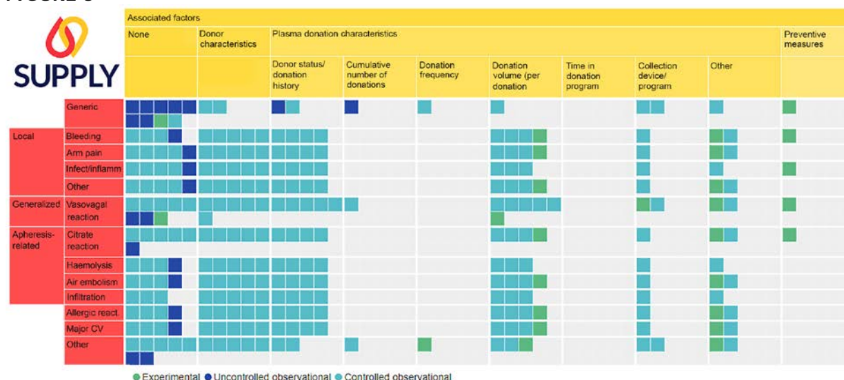
FIGURE 3. Evidence gap map with adverse events. The columns contain factors that have been studied in association with adverse events. Squares represent studies, subdivided according to study design. An interactive version of the map is available online , in which descriptions of categories can be obtained by hovering over the column/row headers, lists of studies within each category can be obtained by clicking on the map, and studies can be filtered based on study design, publication type, publication date, location, publication language, follow-up period, population, and whether or not convalescent plasma was donated. Generated using v.2.2.4 of EPPI-Mapper powered by EPPI Reviewer and created by the Digital Solution Foundry team.