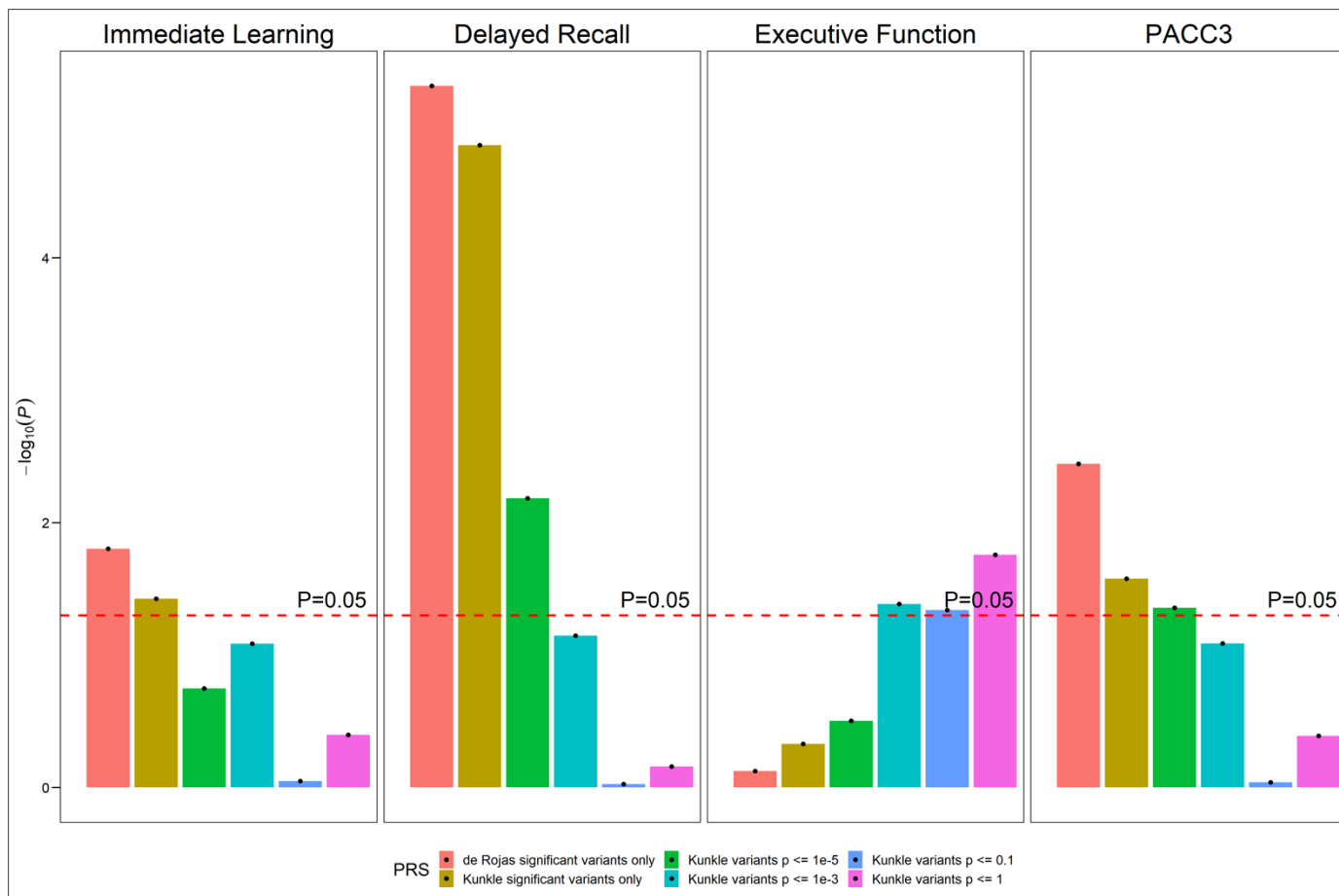
Figure 3 presents the -\log_{10}(P) from the likelihood ratio tests for the three-way interaction terms for all outcomes and different PRSs in WRAP. The likelihood ratio test statistic is calculated as the ratio between the log-likelihood of the nested model (model without three-way interaction terms) to the full model (model with polynomial age*PRS* APOE terms). All association tests are performed using linear mixed effect model with random intercept at subject and family level; Additional covariates include gender, education, practice effects, family history of Alzheimer's, and the first five principal components of ancestry. Age is centered at year 65 and education is centered at the mean. PACC-3 = Preclinical Alzheimer's Cognitive Composite Score-3.