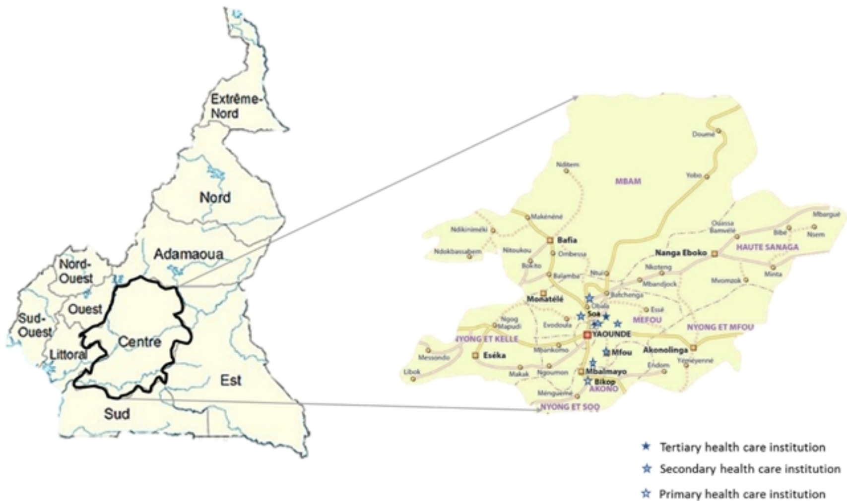
Figure 1: Map of ten regions of Cameroon.