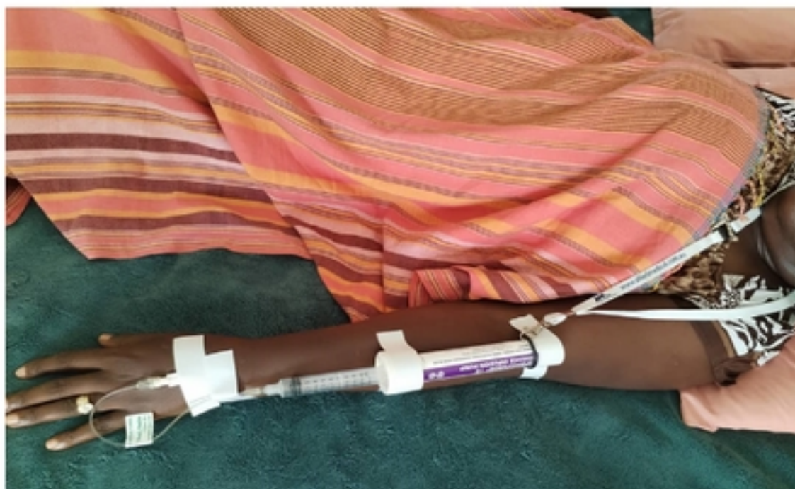
Fig. 3 Showing participant with Springfusor pump with magnesium sulphate administered through a canula. The neck suspension string enables participants mobility without fear of dislodging the canula.

medRxiv preprint doi: https://doi.org/10.1101/2023.05.16.23290038 ; this version posted May 22, 2023. The copyright holder for this preprint (which was not certified by peer review) is the author/funder, who has granted medRxiv a license to display the preprint in perpetuity. This article is a US Government work. It is not subject to copyright under 17 USC 105 and is also made available for use under a CC0 license.