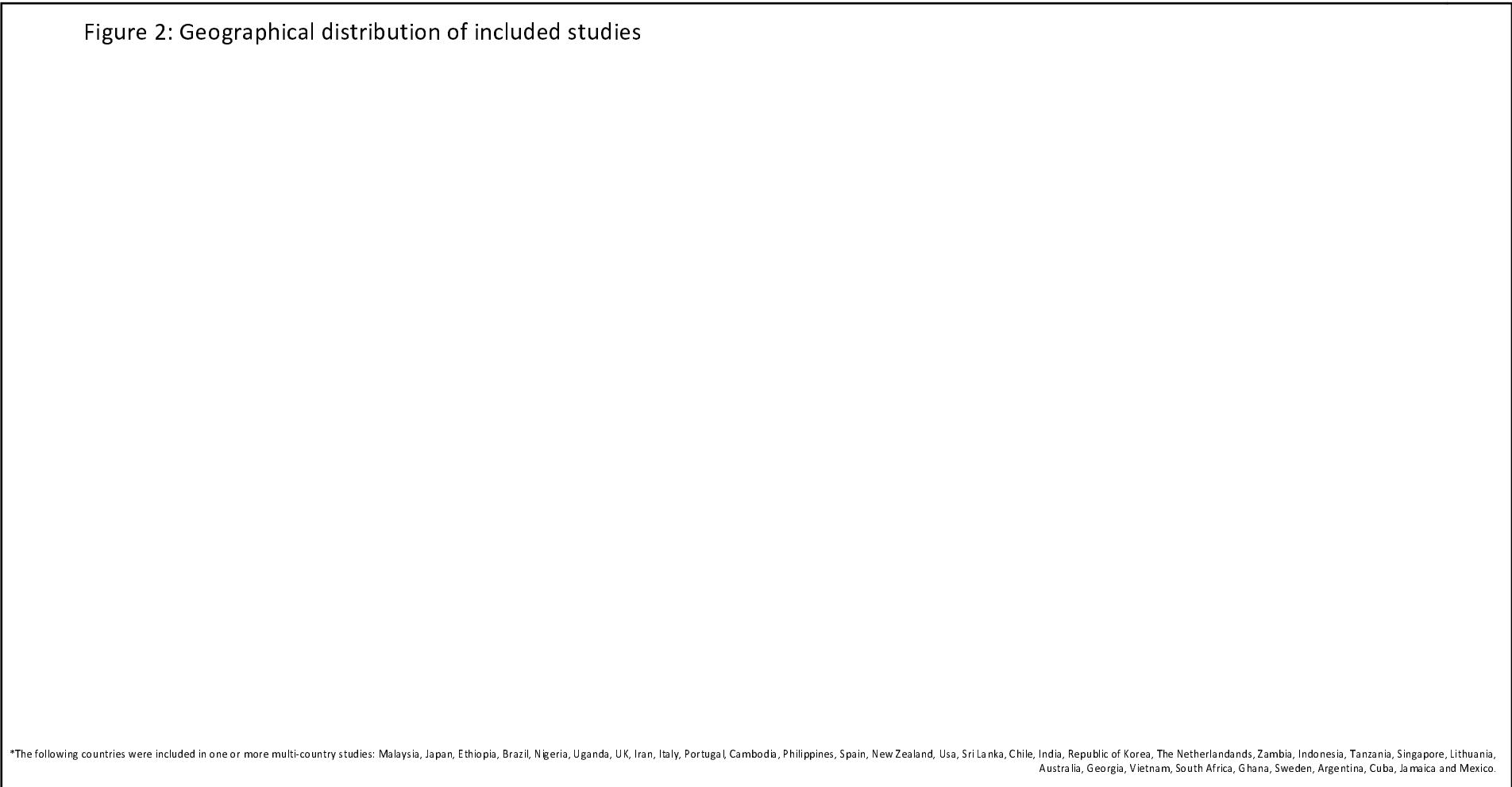
Figure 2: Geographical distribution of included studies